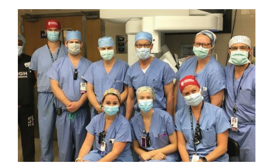
MGH Cardiac Robotic Team after completing their first robotic mitral valve repair.